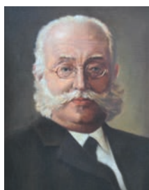
DLG founder Max Eyth