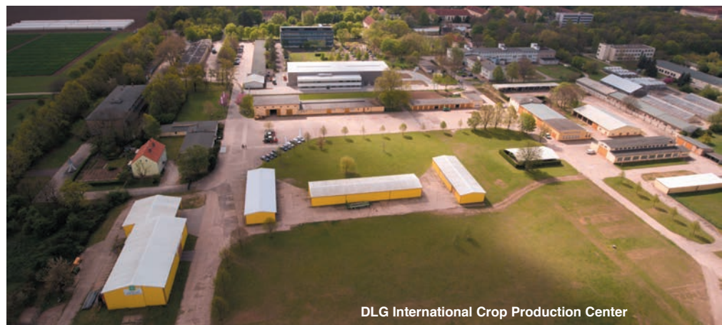
DLG International Crop Production Center

DLG's two competence centers – Agriculture and Food – organize congresses, conferences and forums and are important platforms for professional dialogue and innovation. These offerings are complemented by various publications such as DLG papers, DLG Expert Knowledge and international trend analyses. The DLG Academy gives its students the opportunity to gain key qualifications for the future, ranging from practical skills to strategic business planning. Knowledge management at DLG aims to find solutions for the markets of tomorrow – today.